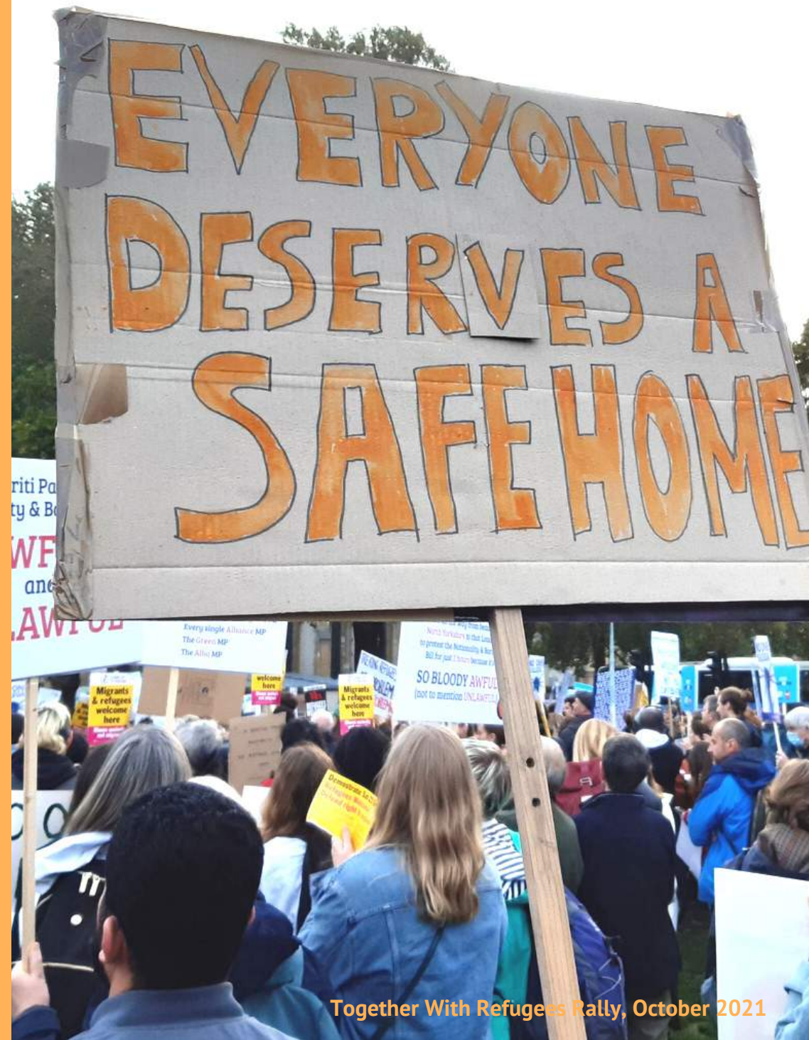
Together With Refugees Rally, October 2021