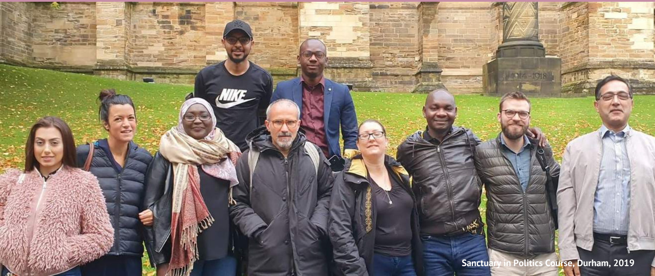
Sanctuary in Politics Course, Durham, 2019

The Sanctuary Ambassador network is a vibrant, inclusive and creative team of advocates passionate about building a culture of welcome and encouraging others to join the movement for a fair, effective and humane asylum system. Sanctuary Ambassadors share and advocate City of Sanctuary's vision. Ambassadors participate in streams and awards work, social media, sharing of stories through the media, awareness raising opportunities and support for sector wide campaigns. They also contribute by shaping how the City of Sanctuary operates, for example through feeding into the Experts by Experience Operational Advisory Group and being part of the streams steering groups.