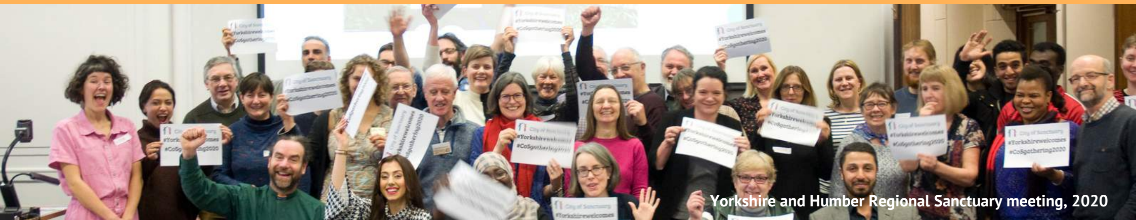
Yorkshire and Humber Regional Sanctuary meeting, 2020